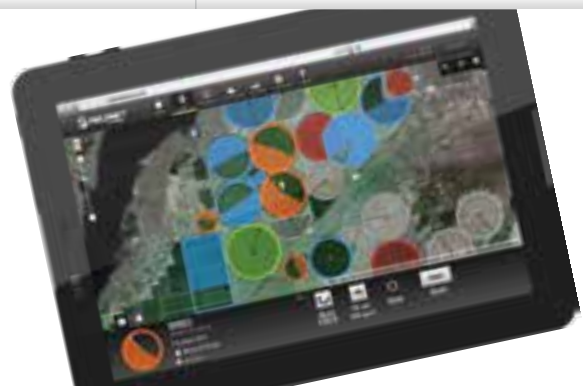
FieldNET™ Wireless Irrigation Management