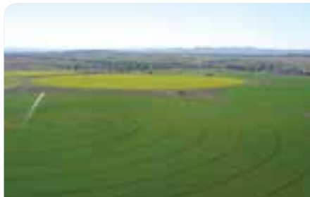
Alfalfa (lucerne) (foreground) and flowering canola (background) are among several crops irrigated at Tamworth.