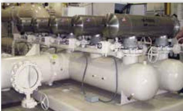
The pump station was custom-engineered and performance-tested, as shown above, at the Watertronics facility in Hartland, Wisconsin, USA.

"The pump station design was a combined effort of Realm