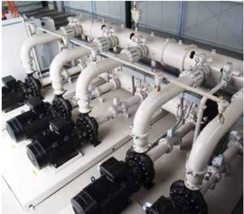
To conserve land and water resources, a Watertronics pump station (above) and 13 new Zimmatic center pivots were installed to irrigate local crops with the town's treated wastewater.

In addition, the project required accurate recording of the volume of wastewater applied through the pivots, high rainfall shutdown capabilities and "burst pipe" alarms.