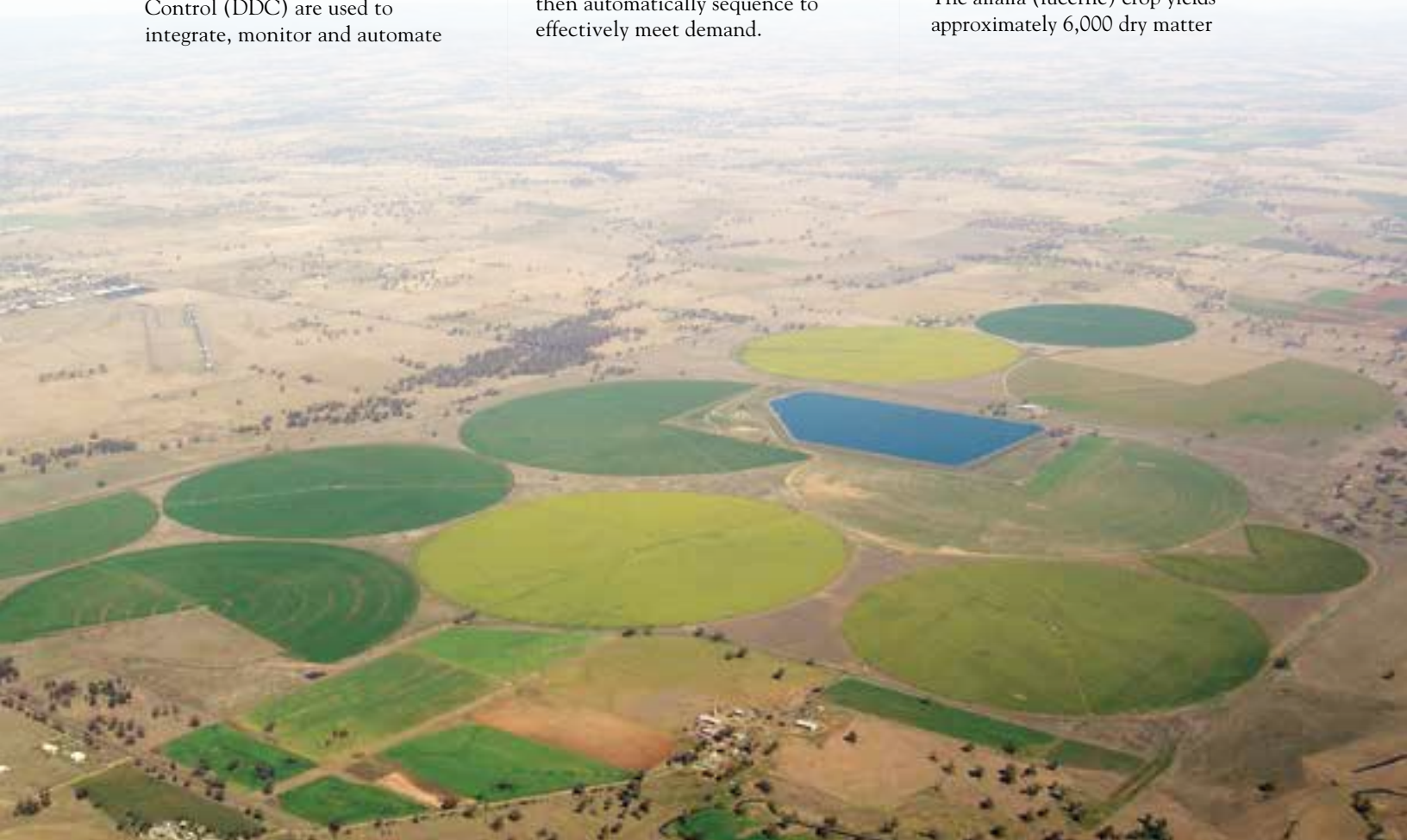
Aerial view of the Tamworth City wastewater reuse project in Australia. The wastewater storage pond can hold up to 396 million gallons (1,500 ML) of water, which is then pumped onto local crops through 13 new Zimmatic center pivots.

The alfalfa (lucerne) crop yields approximately 6,000 dry matter