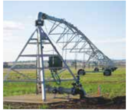
One of the 13 new Zimmatic poly-lined center pivots at Tamworth.

1,585 million gallons per year (6,000 ML/year), with future expansion capabilities built into the system if needed.