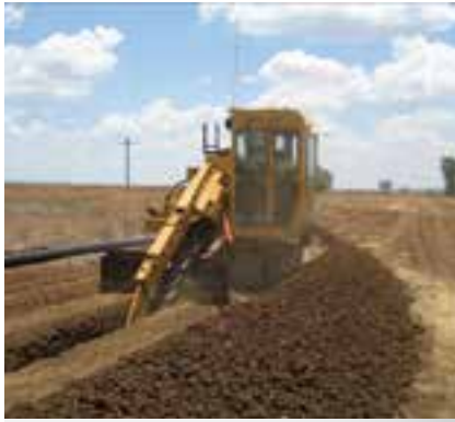
Trenching the nearly 8 miles (13km) of pipe that moves the effluent from holding ponds onto area crops.